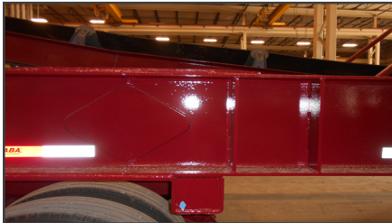
Wide Flange Beam Chassis

*NOTE: Listed weights are not exact. Actual weights will vary based on axle configuration, options, etc.*