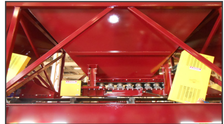
1/4" Mild Steel Plate Hoppers