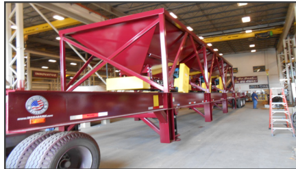
Steel Square Tubing Supports