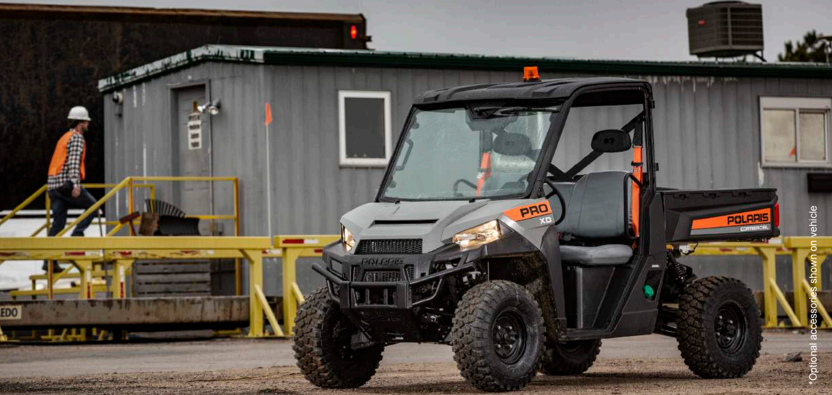
*Optional accessories shown on vehicle