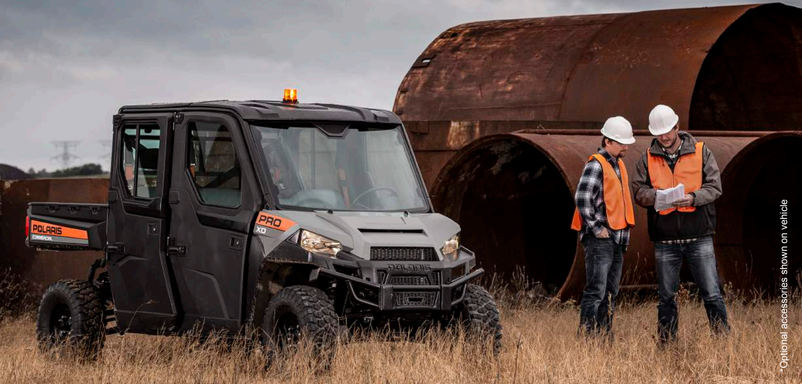
*Optional accessories shown on vehicle