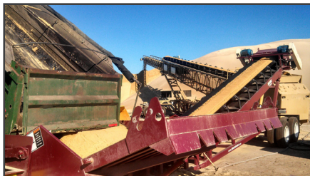
Self Cleaning Hydraulic Ramps

*NOTE: Listed weights are not exact. Actual weights will vary based on options*