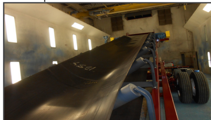
48" 3-Ply Belting Vulcanized Splice