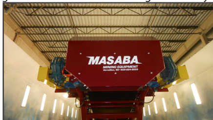
48" Discharge Conveyor with Discharge Hood